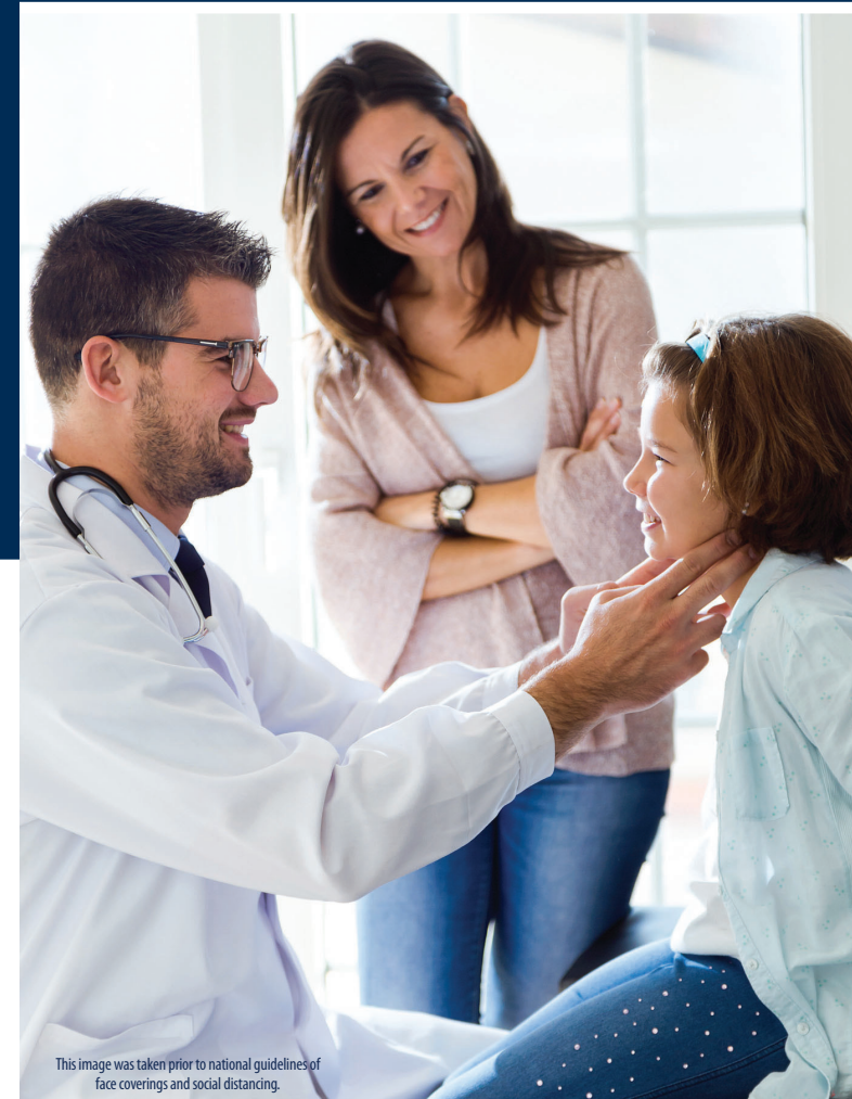
This image was taken prior to national guidelines of face coverings and social distancing.

Leading-Edge Research. Exceptional Care.